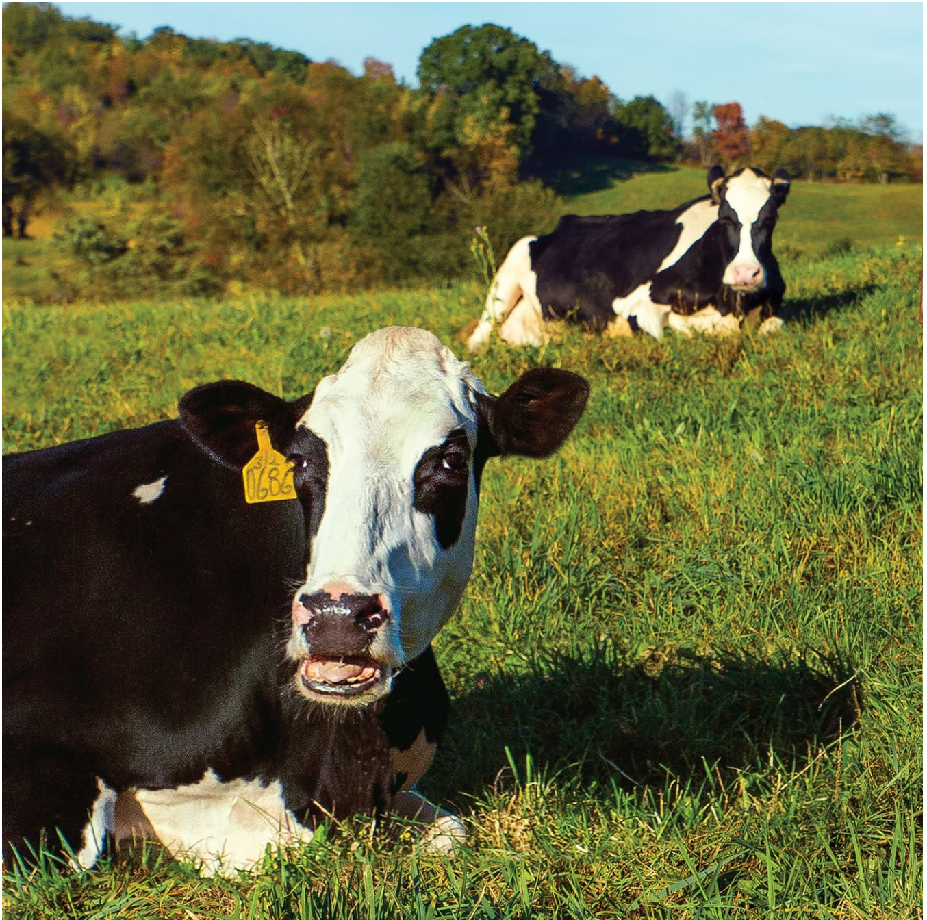
Ronnybrook Farm